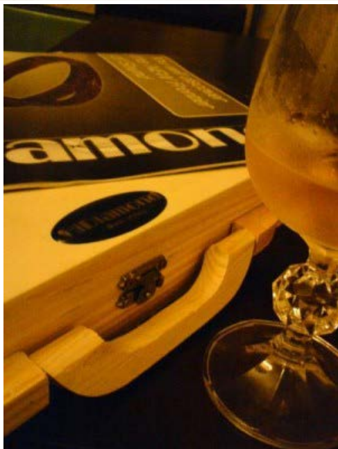
...as to the whiskey glass - that was consumed to celebrate testing. The pine box is actual Black G. casing.

Just a note on the interconnect. Entry's 4VRC conductors are cutely dressed in jacket of hard and well knot material that should prevent skin absorbed signal from hitting back the track. If the sharp pointed and mid-lucid sound is any indication, so it does. Checking this cheapest offering against the ambitious Diamond Small Blue, we switched back to the Entry with yet more respect for the valvy sound quality. Where Small Blue sounds like about any big-time, neutral and power-wielding, transducer, Entry does make music worth craving. It is plain beautiful. Period.