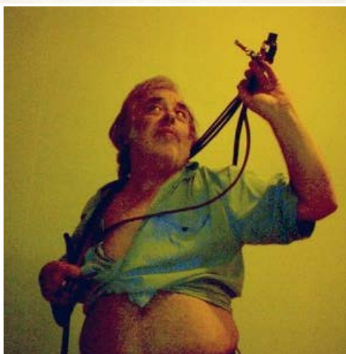
Yelbaev Laocoon overpowering The Hi-D Cable